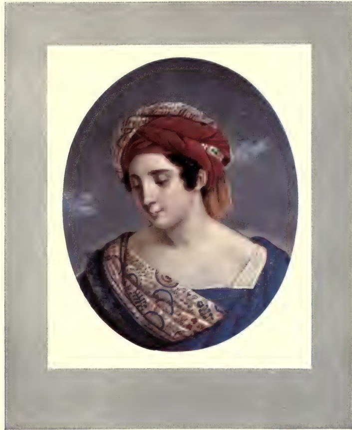
PRINCESS PAULINE BORGHESE BY B. ANGISSOLA